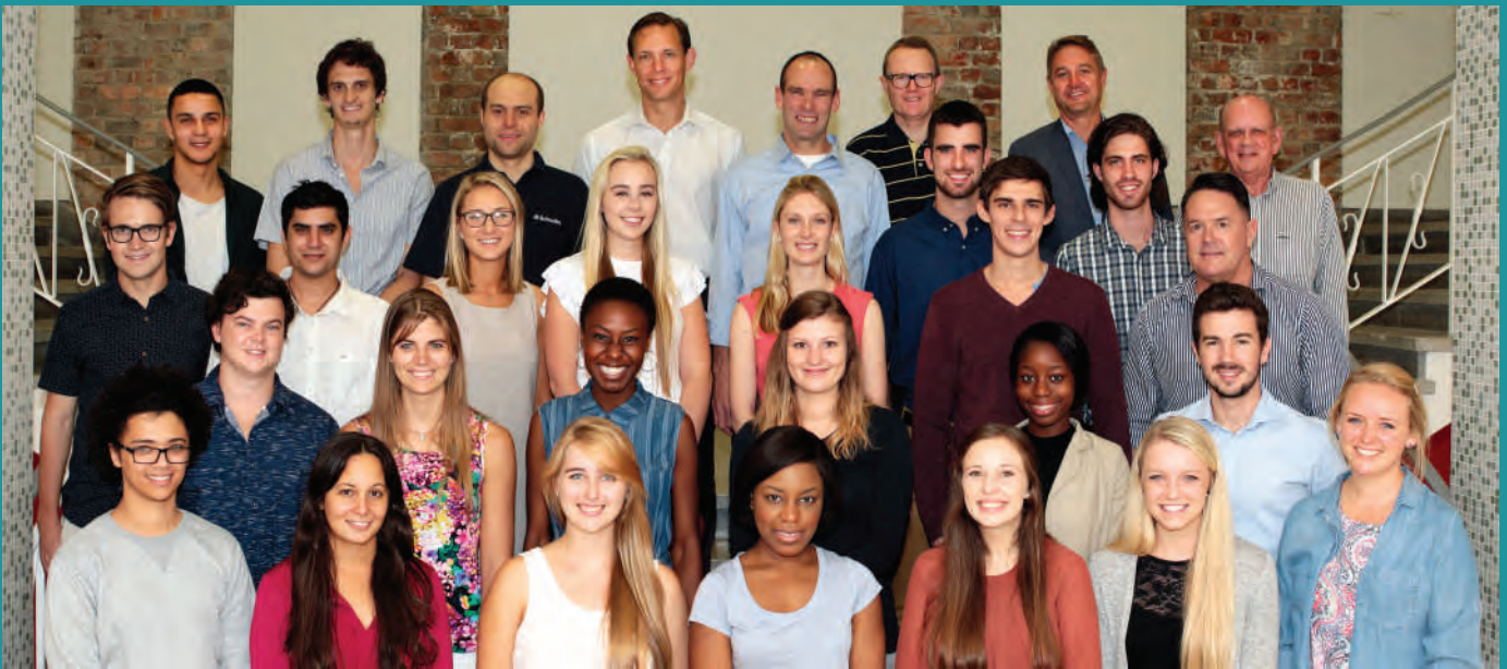
The financial assistance provided by Schroders in the form of postgraduate bursaries is an important part of this international company's agreement with Stellenbosch University (SU). Here are the 2017 Schroders bursary recipients alongside conference speakers as well as representatives of Schroders, Correlation Risk Partners and SU's Department of Statistics and Actuarial Science.

Click here for more information on the presentations.