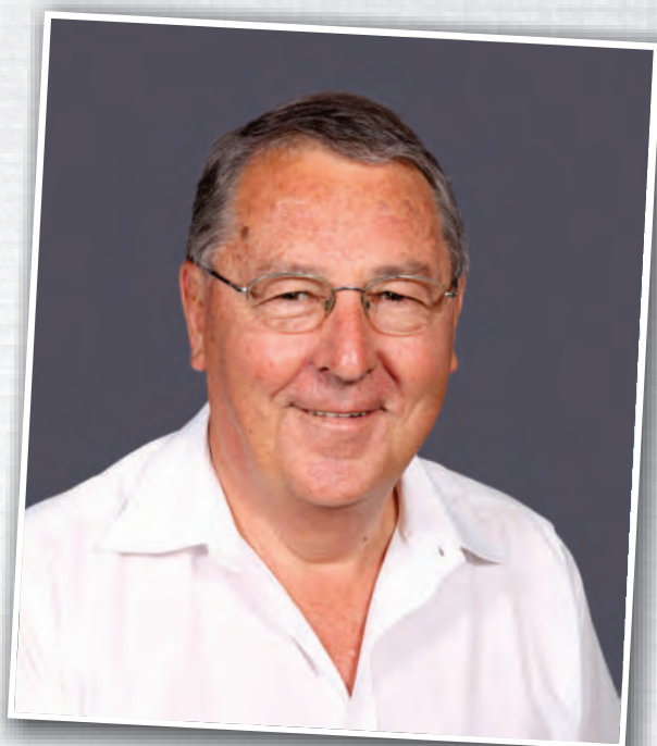
Prof Tertius de Wet

gave a very interesting talk with the title: "Living in a 3D environment with multidimensional challenges: Visualising multivariate data". The theme of his talk was that although we live in a three-dimensional world, it is full of multidimensional challenges. A technique called biplots approximates multidimensional structures and relationships between variables in a two or three-dimensional space. The use of biplots was illustrated with two data sets. First, Niël provided a visualisation of the relationships between the variables from a data set on staff remuneration of Stellenbosch University academics. This data set included a mixture of continuous variables (e.g. age, years' experience and research output score) and categorical variables (e.g. gender and qualification(s)). A second example illustrated how this technique can be used to create visualisations of changes over time. Data on crime in South African provinces between 2004 to 2013 was used and illustrated increases and decreases in certain types of crime in a specific province over the time period.