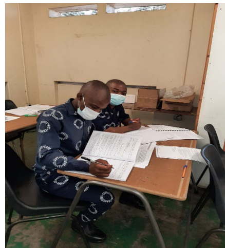
Figure: Students engaging with workshop material