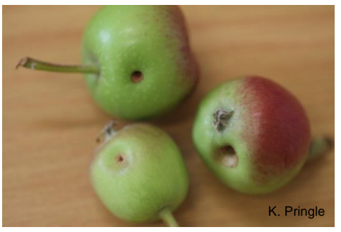
African bollworm feeding damage.