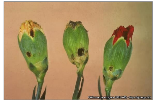
African bollworm feeding damage to carnation flower heads.