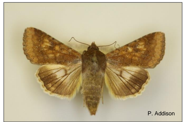
African bollworm, Helicoverpa armigera, adult.

Monitoring for African bollworm is best accomplished through manual scouting for eggs and larvae in a standardized manner which varies from crop to crop. Economic action thresholds have been developed for many South African crops. Insecticides should not be applied unless action thresholds are exceeded, as African bollworm readily develops resistance to insecticides. For some crops, like Bt -cotton, genetically modified cultivars have been developed which prevent African bollworm infestation.