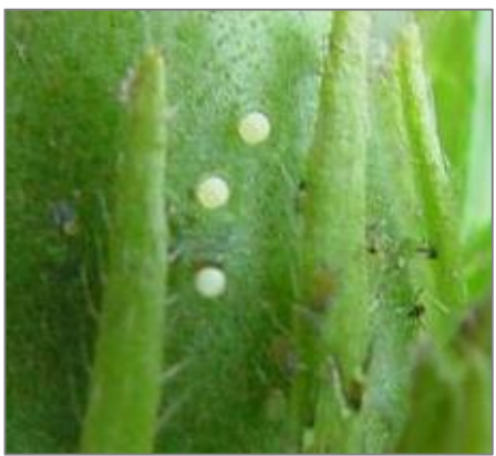
African bollworm eggs.

Stout-bodied moth which has a broad thorax which tapers toward the abdomen. Colour varies form dull yellow, pale brown to reddish-brown. A dark band is often present across edge of forewings, with a dark spot in the middle of the wing. Hind wings are paler, greyish-white with dark brown edges.