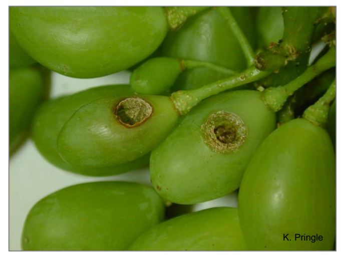
African bollworm feeding damage to grape.

Recommended integrated measures vary from careful monitoring and timing of chemical insecticide applications, to augmentation or introduction of natural enemies, to cultivation of genetically-modified crops which are resistant to damage by African bollworm, such as Bt -cotton.