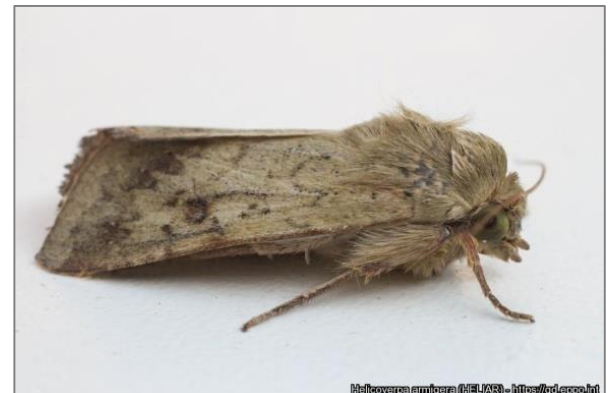
African bollworm.