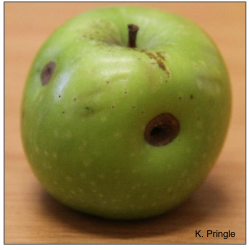
African bollworm feeding damage to apple.