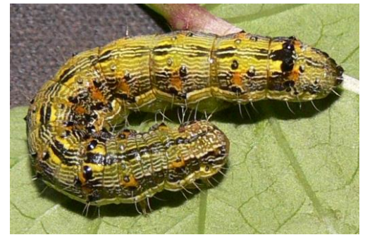
African bollworm larva.