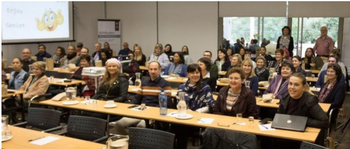
The Blueprint workshops began on Monday 10 June 2019 with Academia demonstrations in true movie style fashion including popcorn!

The first phase of the SUNStudent project consists of Blueprint workshops during which all relevant capabilities are discussed with key stakeholders. This phase kicked off on Monday 3 June with Change Management preparation and Blueprint workshop general information sessions as precursors to the Blueprint workshops. The Blueprint workshops are aimed at providing Serosoft with the opportunity to understand SU processes, while simultaneously creating the opportunity for SU staff to understand what Academia has to offer. They furthermore allow SU to rethink and align current processes with international standards. The workshops will run until April 2020. The different capabilities are divided into buckets , aiming for an even distribution of the workload of staff with regards to project activities within our daily routine and business-as-usual activities.