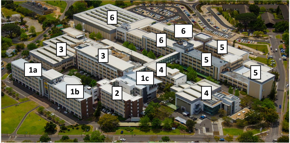
Figure 1.1: The building complex of the Faculty of Engineering (the numbers are used in the descriptions below).

The current building complex in Banghoek Road, Stellenbosch, was completed in the seventies and since then it has been expanded from time to time; for example, when the Knowledge Centre was added in 2012. The figure below shows an aerial photograph of the current complex.