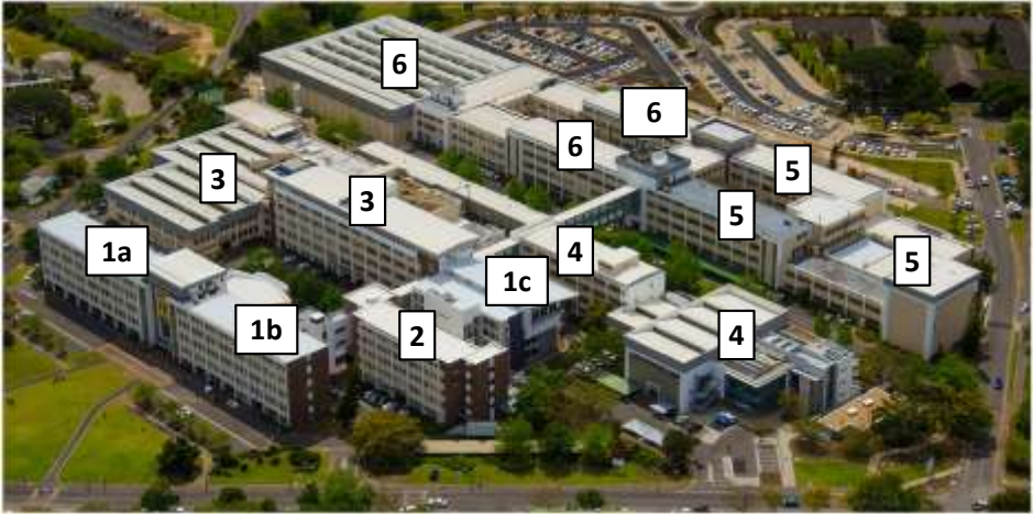
Figure 1.1: The building complex of the Faculty of Engineering (the numbers are used in the descriptions below).

The current building complex in Banghoek Road, Stellenbosch, was completed in the seventies and since then it has been expanded from time to time; for example, when the Knowledge Centre was added in 2012. The figure below shows an aerial photograph of the current complex.