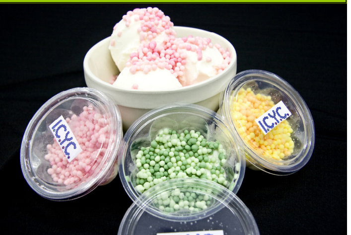
Group 5 I.C.Y.C a fruit flavoured true yoghurt coating for ice cream