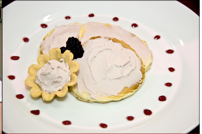
Group 4 Cremé a la Berries is a fruit berry flavoured cream cheese