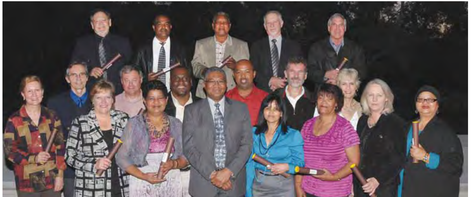
Dié personeellede is onder die 31 wat vanjaar hul Langdienstoekennings vir 25 jaar se diens aan die Universiteit ontvang het.

“Dankie vir die voorbeeld wat julle gestel het, dankie vir al die opoffering en harde werk, dankie vir die vasbyt en die saamstaan deur moeilike tye. Deel asseblief jul ervaring en